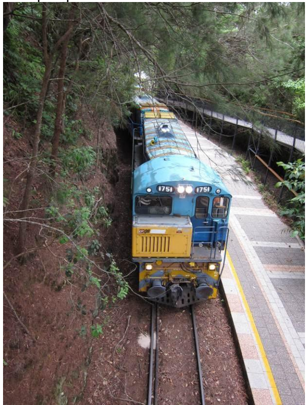
Barron Falls Railway station

Vegetation is not quite typical foothills rainforest. The elevation is not enough to present real upper-level plants and most of those that I recognised are familiar sights around home (at 10 metres elevation). There were quite a few Eucalypt-type trees scattered about, all well-developed and perhaps a remnant of the time when the area was open forest. Quite large specimens of Red Mahogany ( Eucalyptus pellita ) were