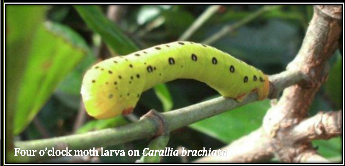
Four o'clock moth larva on Carallia brachiata

Clearing and planting are continuing on the western side with some interesting species such as the Noni tree Morinda citrifolia . Some of the smaller plants there are under assault from the exotic invasive twiner Centrosema which can smother a small tree if unchecked. Other vines are abundant, and there were a few species of Mistletoe which had a particular affinity to waterside Melaleucas.