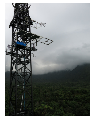
Crane structure, with climate monitoring instruments