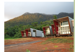
New accommodation and labs at the DRO site

Alyxia spicata Sarcostemma viminalis subsp. brunonianum Canarium australasicum Gmelina dalrympleana Plectranthus apreptus Litsea breviumbellata Solanum viridifolium Piper caninum