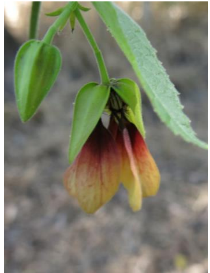
Bizarre and beautiful – flower of Abroma mollis