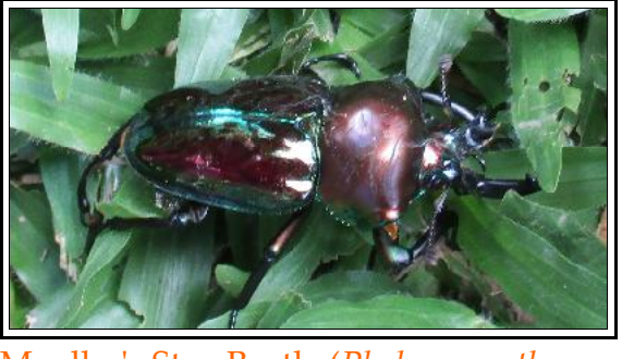
Mueller's Stag Beetle ( Phalacrognathus muelleri : LUCANIDAE)

the Cairns City environs; we'll do some general mangrove I.D. at the same time so it promises to be a fun and educational.