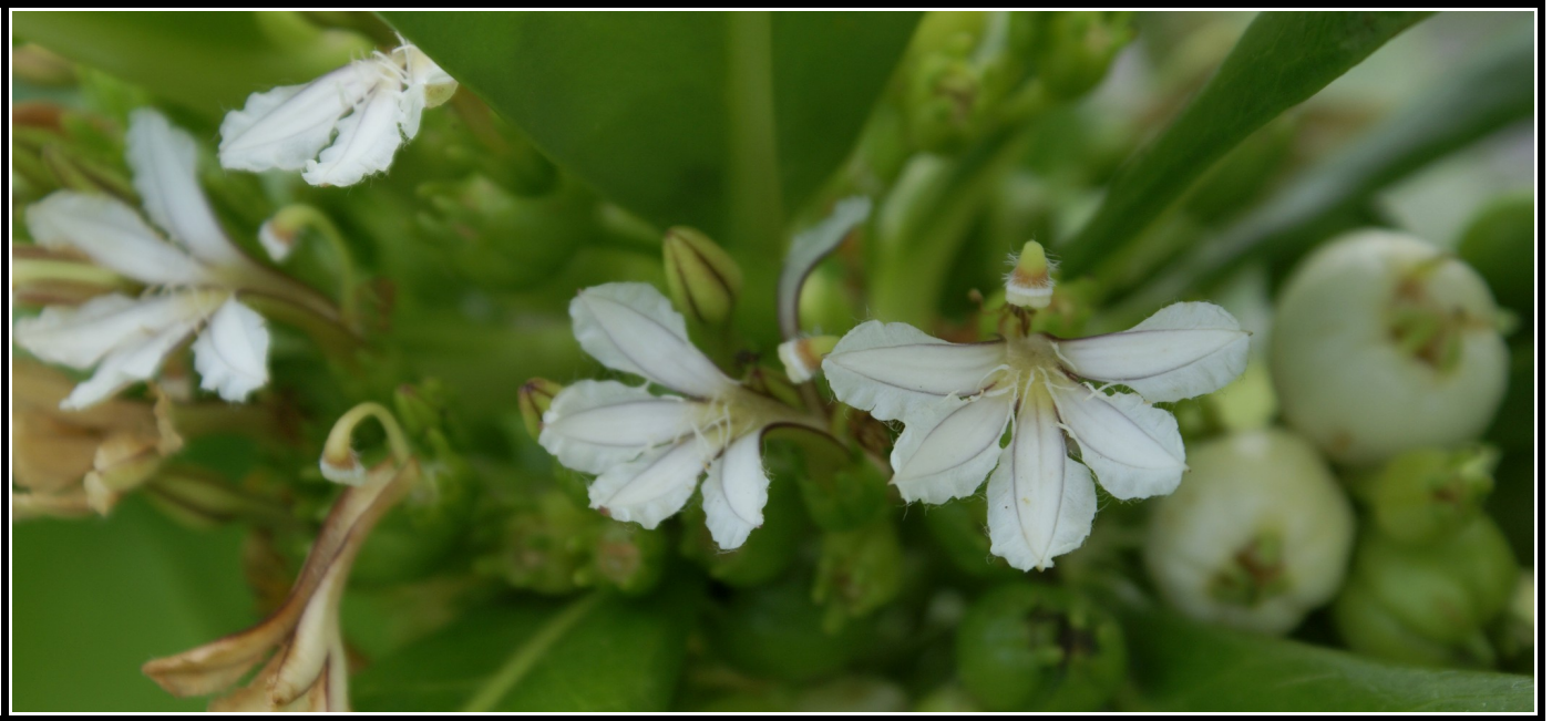
Scaevola taccada .