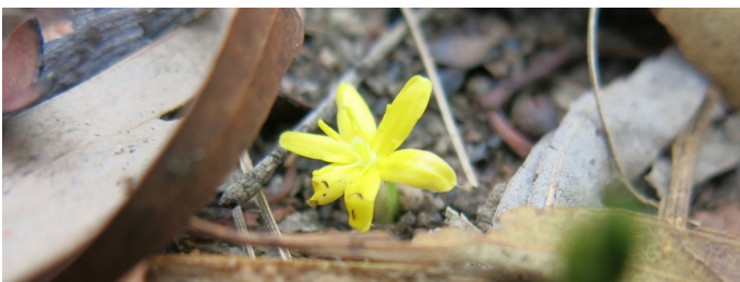
Hidden in the leaf litter, Curculigo ensifolia .