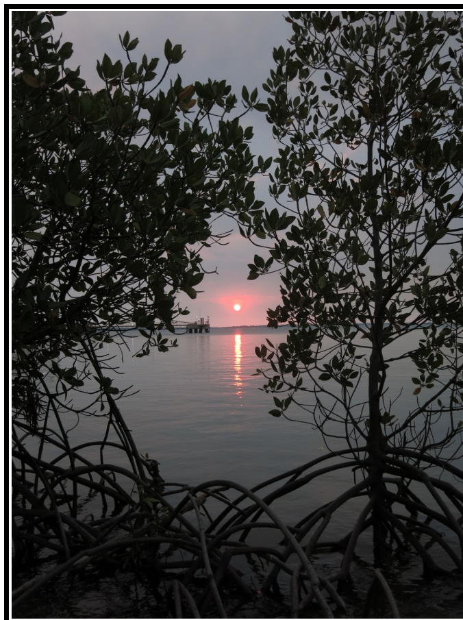
Bushfire sunset at Weipa, with red mangroves ( Rhizophora ) in the foreground.

The title of the talk is Midgies, mozzies and mudskippers: The mangroves of Cairns .