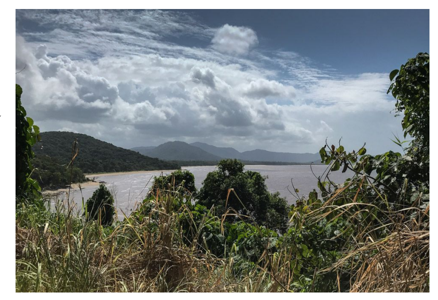
Ella Bay Excursion

Of the 28 fruiting species found, 18 were edible or potentially