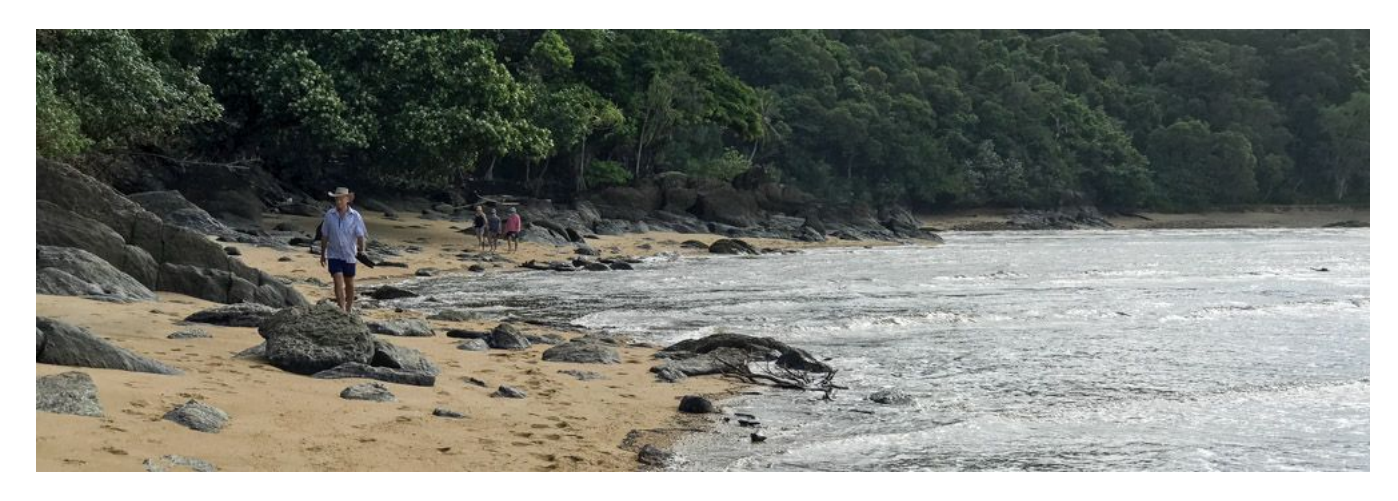
Ella Bay Excursion