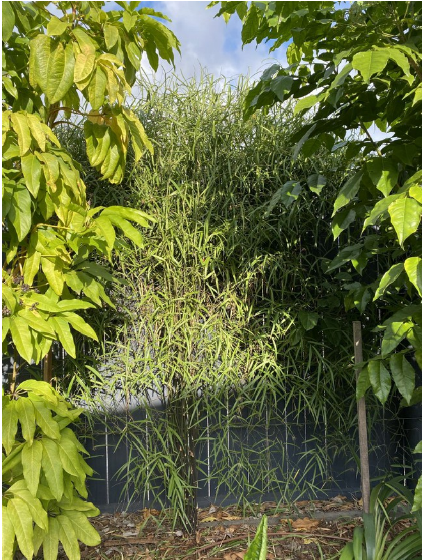
Narrow-leaved form of Eustrephus latifolius , forming an attractive and dense cover for a home fence.

Conversely, it may also be grown unsupported to form a scrambling shrub in a larger garden or placed in a hanging pot to display cascading growth.