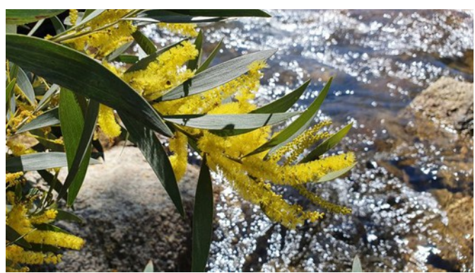
Acacia leptostachya (Townsville wattle) overhanging Davies

drier country before tumbling over its spectacular falls on its way to the confluence with the Barron River. Here in the shadow of the ranges, rainfall is lower and the sandy soils rapidly dry out, resulting in a grassy woodland ecosystem. Amongst the grasses are wild flowers ( Cyanthilium and Wahlenbergia ) and patches of shrubbery. The vegetation here is Australian through and through, dominated bya a canopy of mixed eucalypts and bloodwoods with grass trees, peas, grevilleas and a rich diversity of wattles.