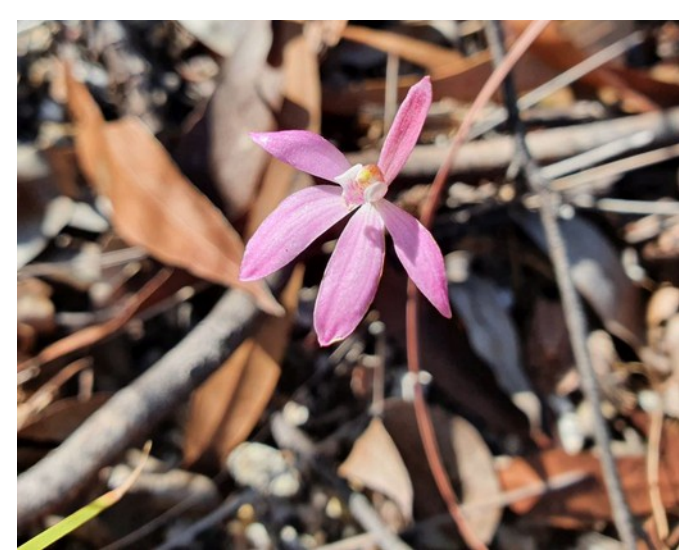
Caladenia carnea (pink fingers)

Along the creek, protected from fire but prone to extremes of wet season flood, grew strong and flexible Myrtaceae: Melaleuca leucadendra , M. viminalis, Tritaniopsis exiliiflora and Syzygium oleosum . In sunny mud patches amongst the rocks we spotted tiny herbs: hat pins ( Eriocaulon ), mosses, Stylidium and carnivorous bladderworts ( Utricularia ).