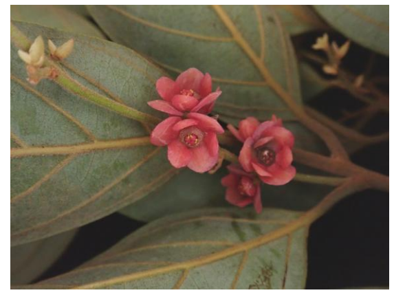
Endiandra hypotephra (Rose Walnut) flowers

Grasses and sedges were numerous but only two, Cyperus multispiceus and Scleria sphacelata contained fertile material which enabled identification, all others remain a mystery.