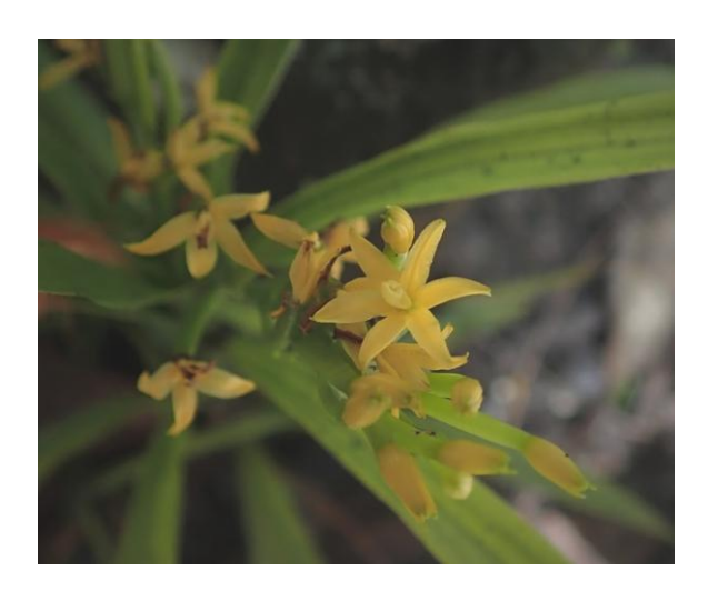
Apostasia wallichii (Yellow Grass Orchid) photographed along the track.

Ferns observed were; Adiantum hispidulum (Rough Maidenhair Fern), Davallia denticulata and Drynaria sparsisora. Cycads there were but one, Cycas media subsp. banksii represented by numerous small specimens.