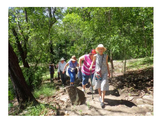
Heading up the hill

glabrum, Pseuderanthemum variable (Pastel Flower) and Eucalyptus pellita (Daintree Stringybark, Red or Pink Mahogany) along with the vines Alyxia spicata and Rhamnella vitiensis.