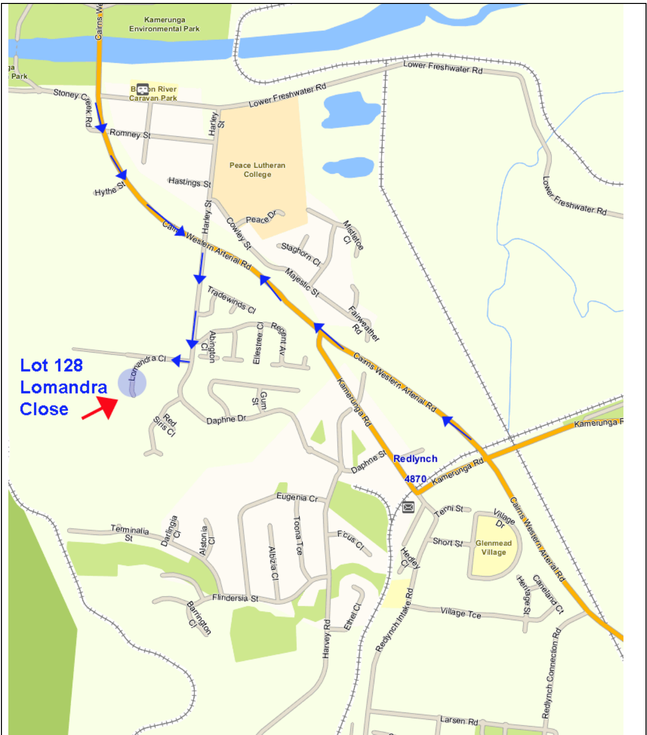
Route Map to Ann Mohun's house, Lot 128 Lomandra Close, Redlynch