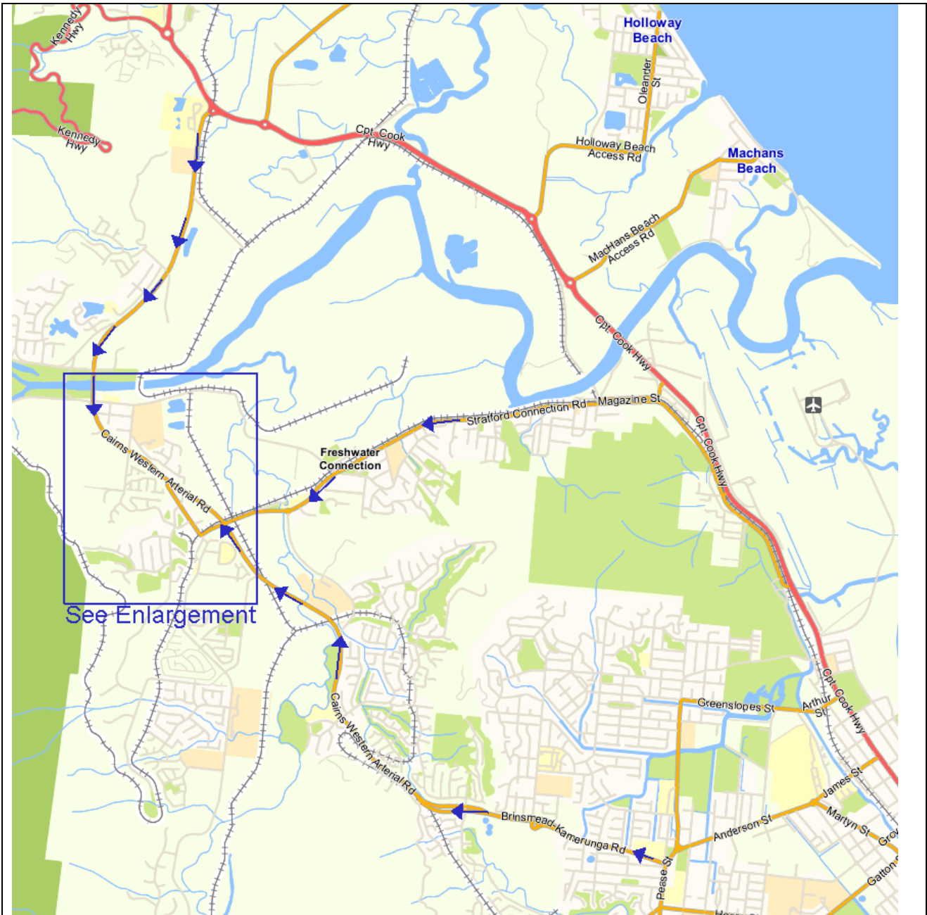
Route Map to Ann Mohun's house, Lot 128 Lomandra Close, Redlynch