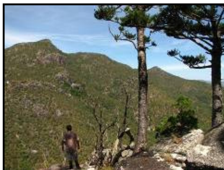
Stu's Mountain from Hoop Pine Hill, McLeod River

Also, apologies for not getting to the last meeting. I was all set to go but had to abandon due to car trouble (after I offered car pooling). Unfortunately I'll also miss Ella Bay as I'll still be up the Cape. So, apologies in advance.