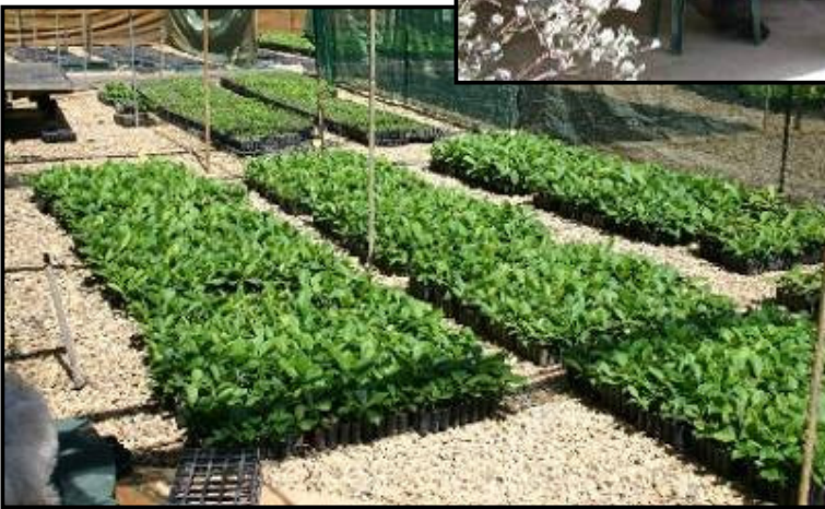
Left: Shade houses where mass produced forestry stock is grown