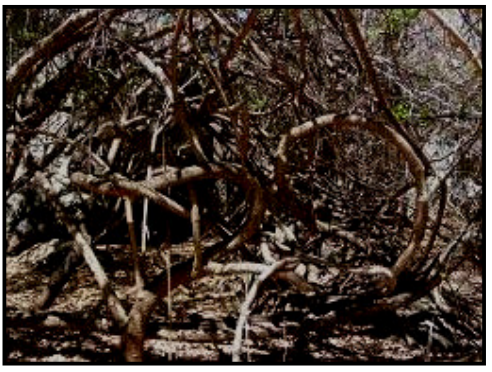
Tangle of Rubber Vine