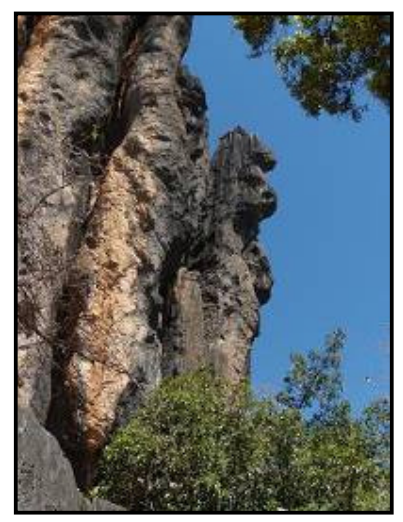
Towering Limestone Karst