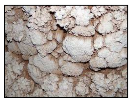
Cave coral feature