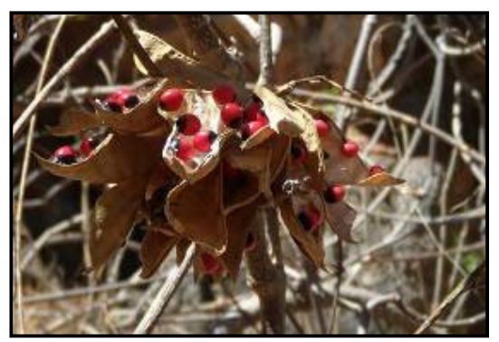
Giddy Giddy Seeds Arbus precatorius