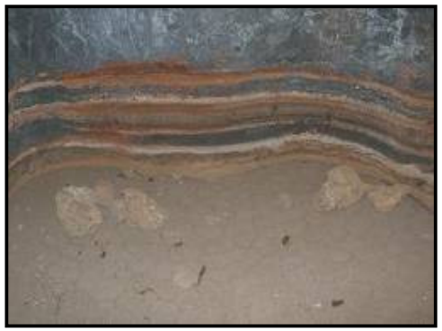
Water level bands below the fossil wall